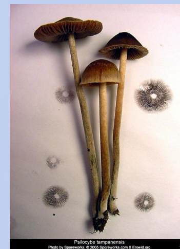
Psilocybe tampanensis

Psilocybin (4-phosphoryloxy-N,N-dimethyl-tryptamine)